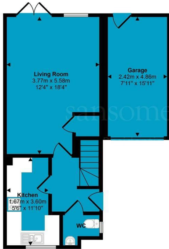
Ground Floor Approx 49 sq m / 523 sq ft

Approx Gross Internal Area 95 sq m / 1022 sq ft